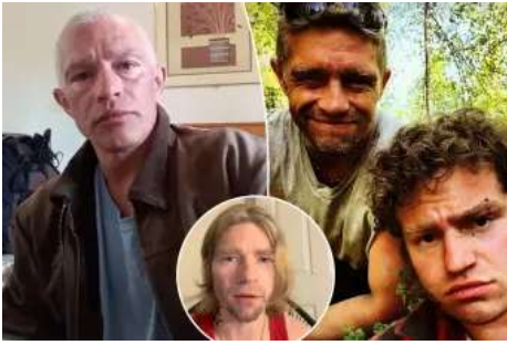
'Alaskan Bush People' star Matt Brown dead at 43 after sibling helped pull body from river, brother says