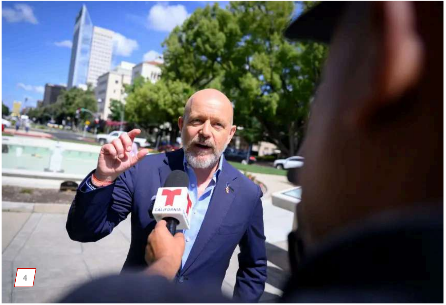
Josh Edelson for CA Post

The poll carries a margin of error of 3.5% and was conducted with a high 95% confidence level.