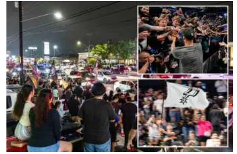
Spurs fan, 17, declared brain dead after horrific accident while celebrating conference final win